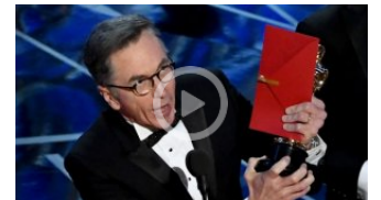
This Guy Finally Won An Oscar After 21 Nominations