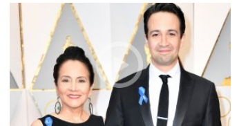
Why The Oscars Red Carpet Was Full Of Blue